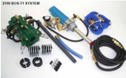
2100-BOS-T1 SYSTEM Cable Size Range: 0.125" (3.2mm) to 1.88" (47.6mm)