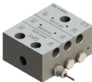
Pictured = 6-fold DPX with visual indicator